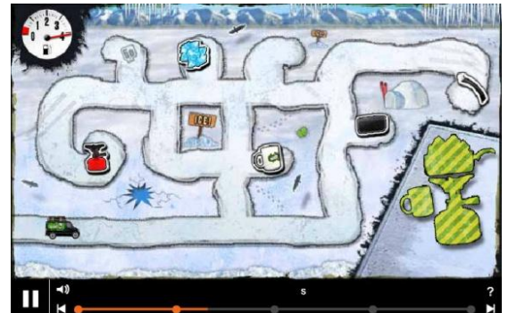
Changing States with Steve: Help Steve change the ice into water he can drink!